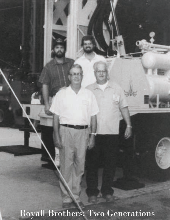
Royall Brothers: Two Generations